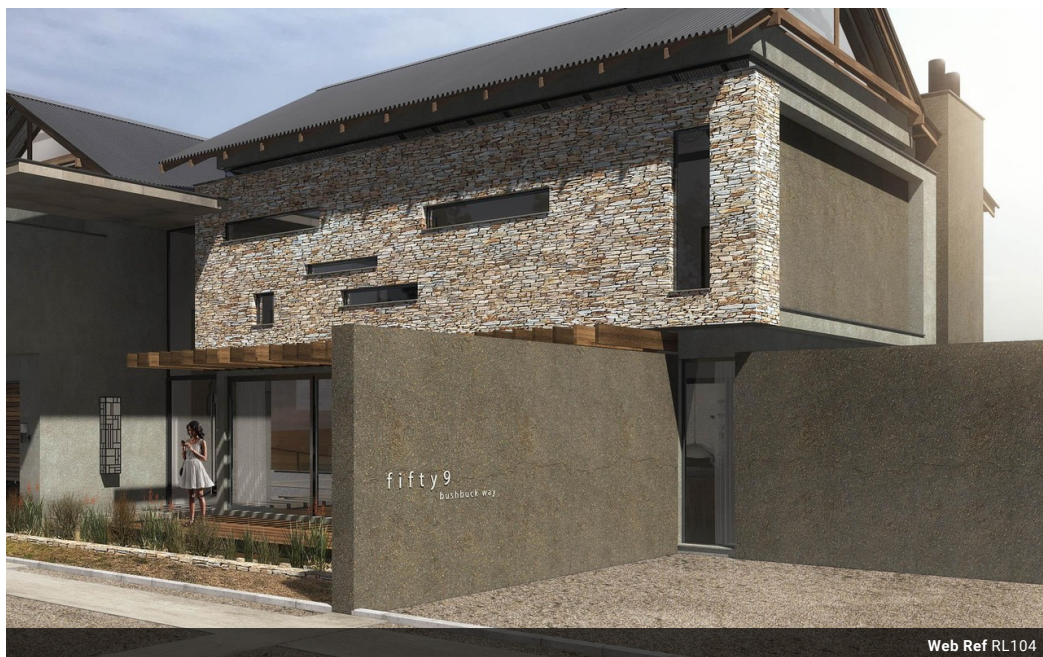
Web Ref RL104

Intaba Ridge Secure Eco - Estate, Pietermaritzburg