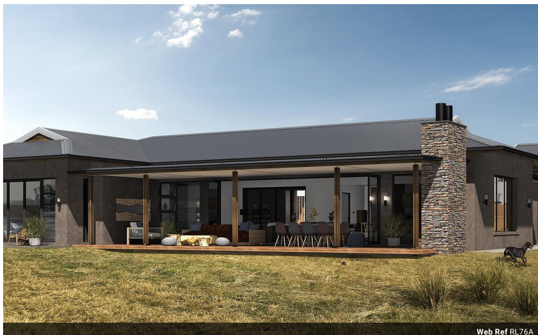
Web Ref RL76A

Intaba Ridge Secure Eco - Estate, Pietermaritzburg